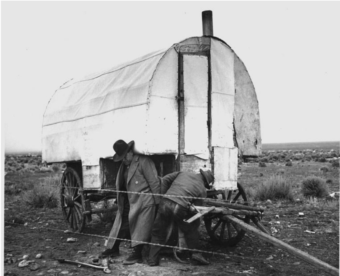
Shepherd's Wagon by Irving Rusinow (license)

Though 70 square feet is still a rigid requirement for habitable rooms, it's actually a step in the right direction. In 2015, the International Code Council reduced this requirement from 120 square feet , making building tiny to code much more feasible. Continuing to adapt existing building codes to tiny abodes, or creating a new certification process specific to tiny homes, would be a big step toward unbanning a housing form that's as old as the shepherd's wagon .