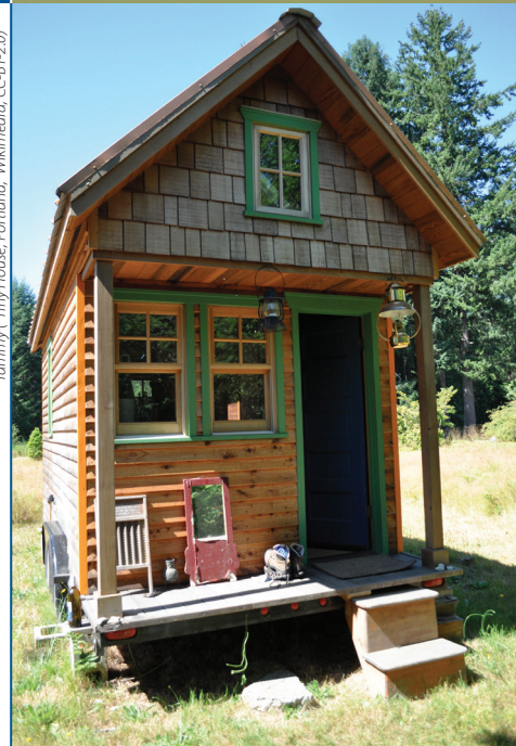
A chassis-mounted tiny house in Portland, Oregon.